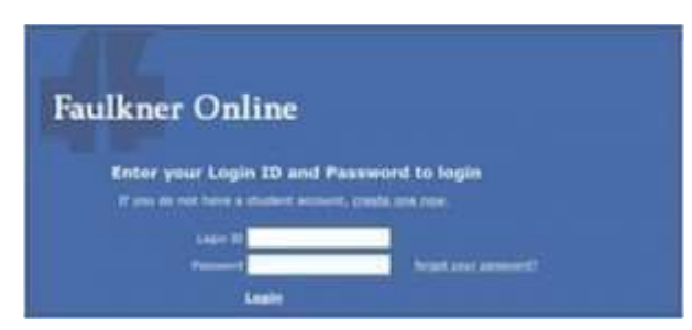
*You will also log onto any Faulkner network PC using the above process.

Your password is set at <a href="https://password.faulkner.edu">https://password.faulkner.edu</a> (same as email password)